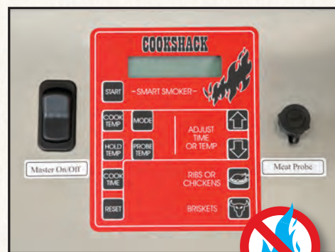
FEC120 Control Panel